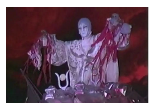
Figure 2: Still from Yukio Ninagawa's

Under multiple pressures, in front of our eyes Medea transforms into a creature that we can no longer place anywhere in our experience: a disconcerting mixture of an intensely loving mother and an honour-