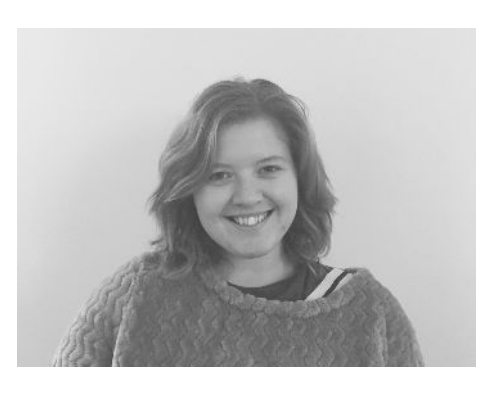
I'm thrilled to be a part of it!

have professionally acted in a feature film, short films, music videos, corporate videos and commercials. My professional theatre debut at the Hen & Chicken Theatre in London, last year, saw me take on the titular role in the new play Aisha which received some outstanding reviews. It has been such a privilege to return to the stage through this production of Medea alongside a fantastic and resilient cast and creative team.