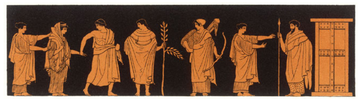
.Figure 1: Greek wedding (or The wedding of Thetis and Peleus): Reproduction of the image on an Attic red-figured pyxis by the 'Wedding Painter', 5th cent. BC, Paris Louvre L55

Granted, Medea may have not literally gone through the process of marriage that Greek women did (see fig. 1) when she came with her husband in Greece.